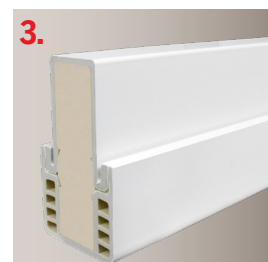
Smooth White Finish