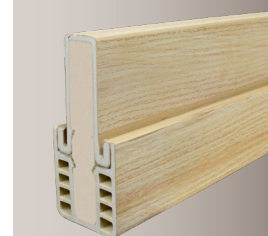
Textured Stainable Finish